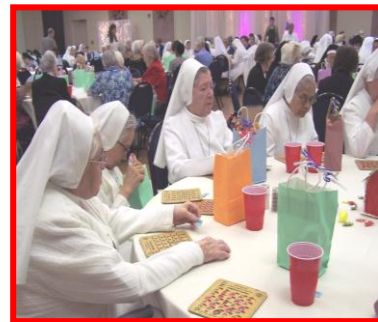
Hermanas Josefinas at Council 4140 Nuns' Appreciation in September.